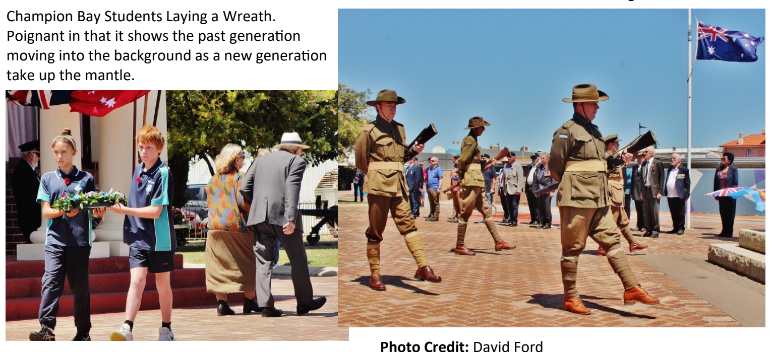
Mounting the Guard