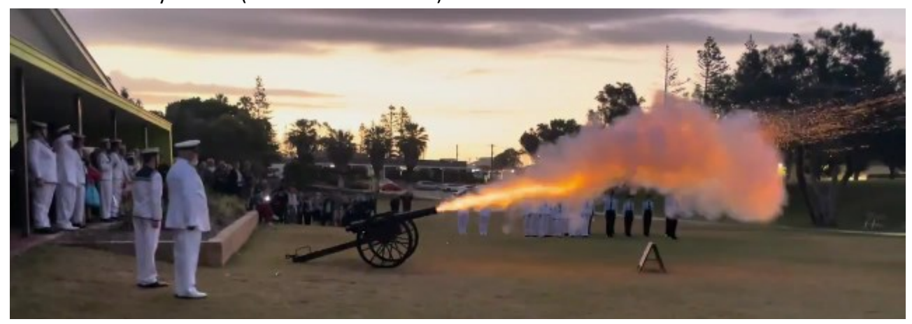
Sunset - Credit: Kelly Monro (Westcoast Fireworks).