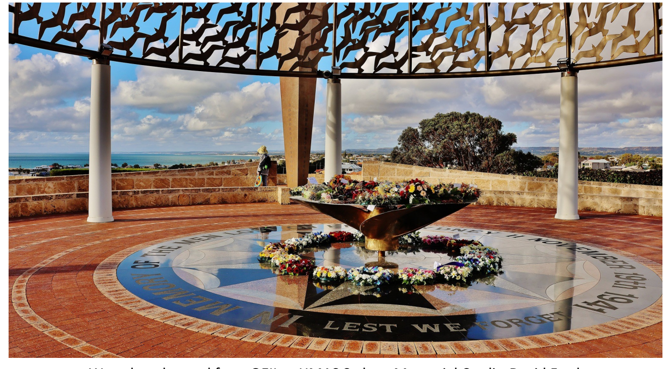
Wreaths relocated from QEII to HMAS Sydney Memorial