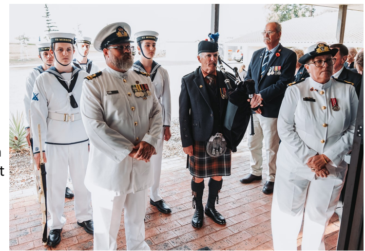
Guard and Veterans preparing to march on.