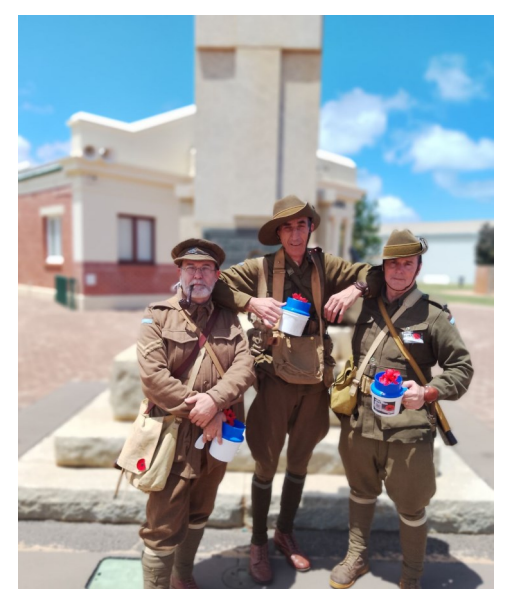
11th Battalion Roving Collectors